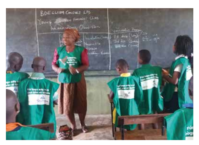
Training for pupils on poultry farming and disease prevention and control.