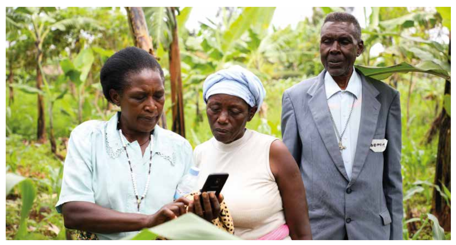
Farmer promoters were involved in the technology design of the BXW App.