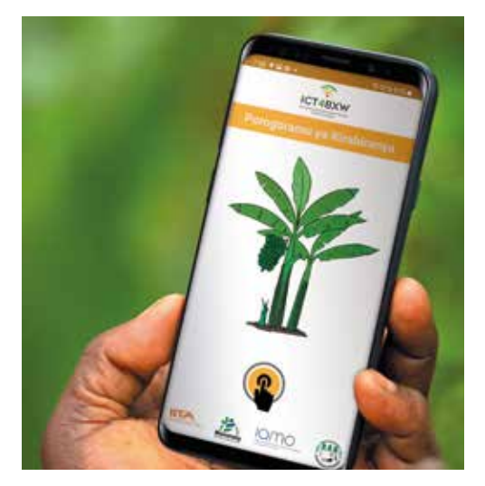
The BXW App is an android-based smart application.

tion was conducted to test the tool under actual field conditions, and assess the confidence and competence of the tool end-users (farmers and farmer promoters).