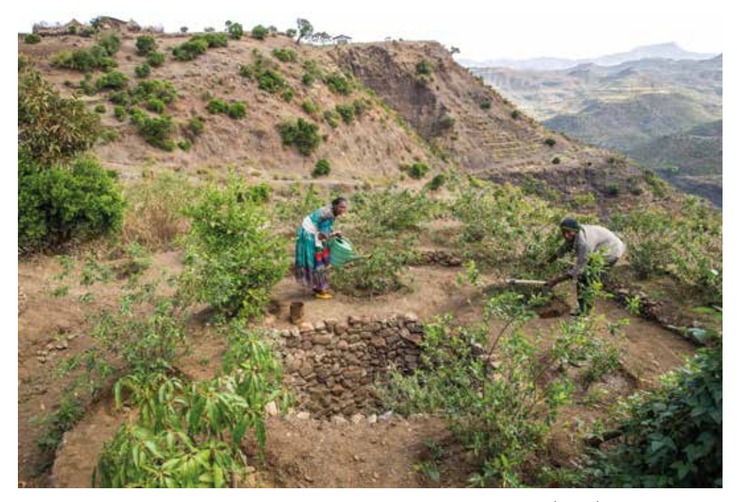
Ring-basin infiltration pit with plantation of drought-tolerant and high-value crops (gesho).

portunity to build savings to absorb frequent livelihood shocks. Market failures such as information asymmetries and impeded market access further inhibit the economic sustainability of the food system and disadvantage producers in particular.