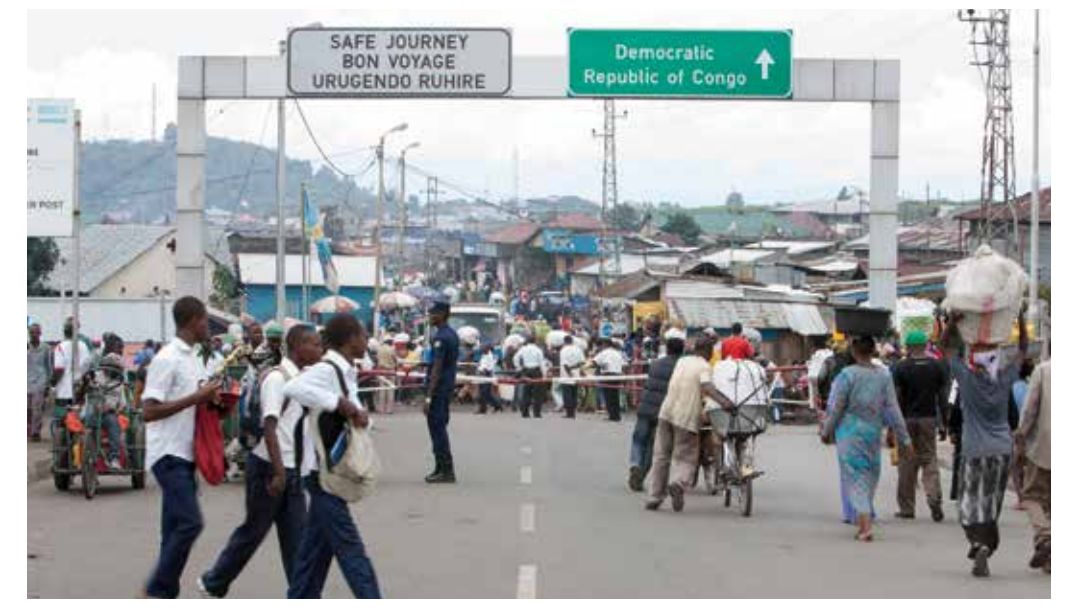
Unsustainable agroecosystems are one of the reasons for migration from rural to urban regions and hence urban growth in sub-Saharan Africa.

Rather than viewing this reality as only a problem or challenge, RUNRES sees the current rural-urban relationship as an opportunity, one capable of facilitating a socio-technical food system transformation. Thus, the rapid