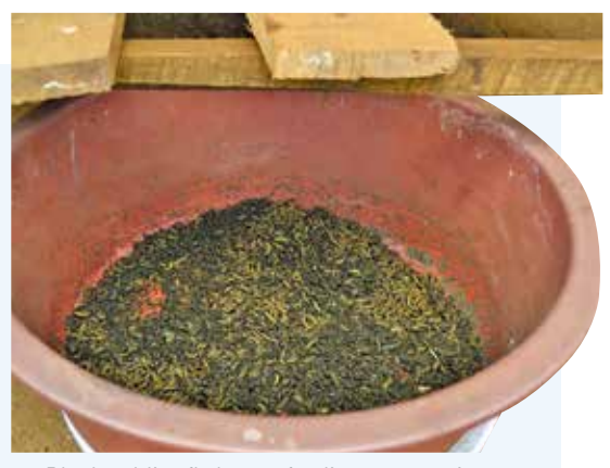
Black soldier fly larvae feeding on organic waste.

Maggot Farm Ltd. offers a solution for this. As part of the RUNRES programme, it produces chicken feed with Black Soldier Fly larvae (Hermetia illucens). The insect consumes vast quantities of organic waste as part of its lifecycle. In this manner, two critical challenges faced by developing countries are addressed: the accumulation of large volumes of organic waste in the urban core of city-regions and the rising cost of protein inputs needed to sustain local poultry production.